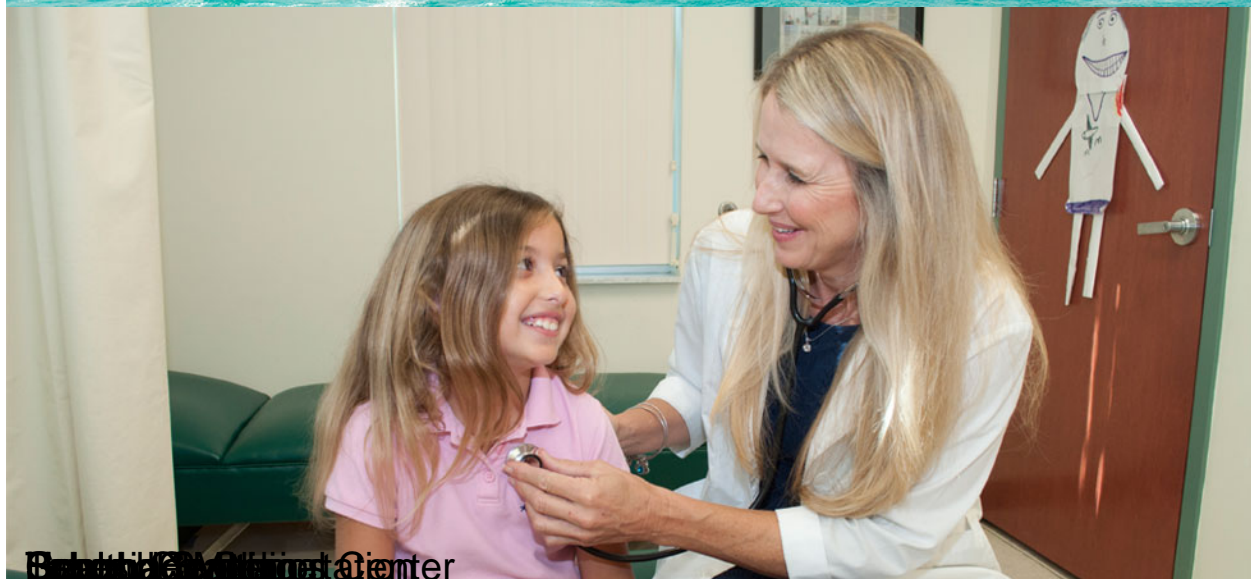
Bobbi K. Bling Center